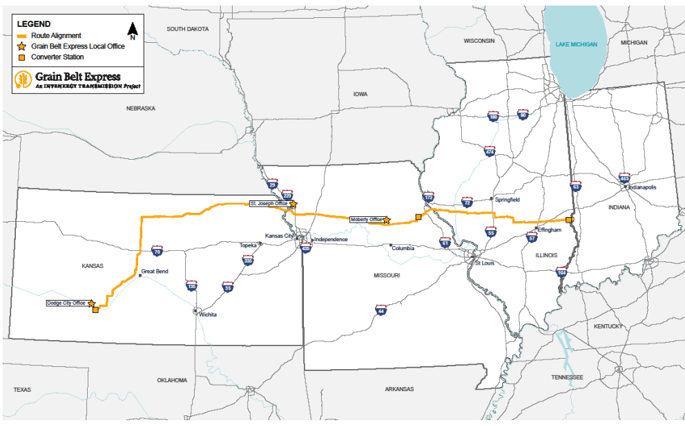
Proposed route of the 800-mile Grain Belt Express transmission line.<sup>5</sup>

Grain Belt Express, LLC is moving ahead with its plan to build a high voltage electric transmission line to carry energy across northern Missouri for energy uses in Missouri, Illinois, and Indiana.